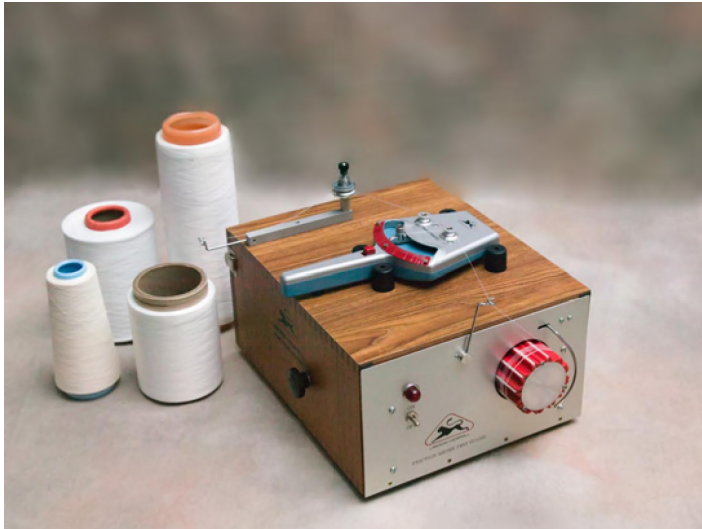
LH-603A Friction Meter and Portable Drive Unit