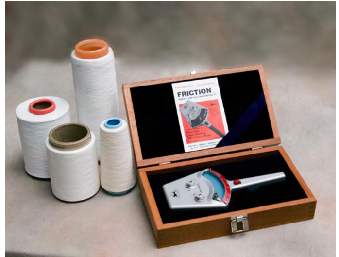
LH-603 Hand Held Direct Reading

Friction and friction build up cause yarn breaks as textile yarns come into contact with different surfaces during the manufacturing processes. The interaction between the yarns and the other elements such as guides, needles, loom parts will cause friction.